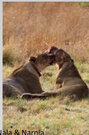
Nala & Narnia