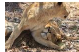
Above: Bisa gives Rwanda a rude awakening at Dambwa

The intention is to let the two groups get to know one another through the fence line over the coming weeks and eventually introduce them to one another for a larger social grouping.