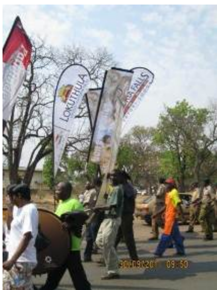
While the project's volunteers took part in a town clean-up, Lion Encounter Zimbabwe staff took part in a march through the town centre

The 27 th of September marked World Tourism Day. A week-long series of events was planned in the town of Victoria Falls and project staff and volunteers got stuck in.